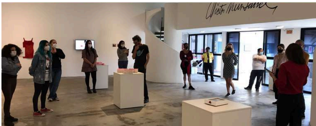
Event carried out on October 13th during the in-person exhibition.